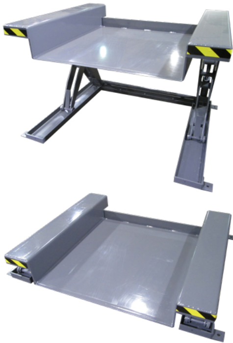
Ground Level Scissor Lift raised position (top) and lowered (bottom)

Alfacon Solutions' GLSL ground level "drive on - drive off" access for pallet trucks & dollies and does not require a pit. The GLSL is a rugged unit, perfectly suited for all types of ergonomic applications & lifting jobs, offering years of maintenance-free service.