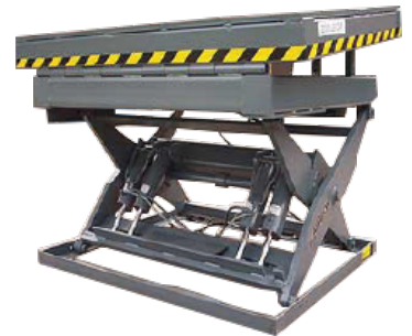
SLS with hydraulic tilt platform

FLIP SPECSHEET TO DISCOVER ALL SUPER LIFT SERIES MODELS AND DESCRIPTIONS