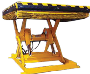
SLS with safety enclosure and painted Safety Yellow