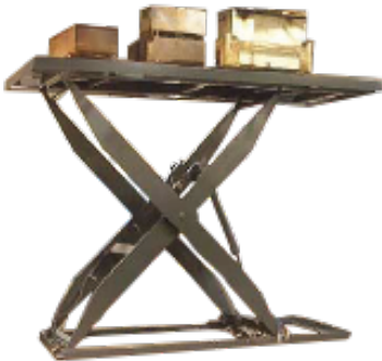
SLS high lift 144" raised height